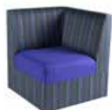
HAR48 Corner unit