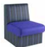
HAR45 Chair no arms