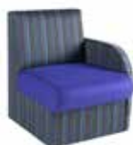
HAR46 Chair with left arm