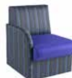
HAR47 Chair with right arm